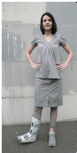
Flatchestedmama embraces gray

Gray is not associated with a bloom. As a mental state, it's indecisive. As an emotion, it calls for pharmaceuticals. If it were a building, no rocks would be hurled at its windows, but neither would they be cleaned. Jasper Johns, the ice man of contemporary art, made it work for him, but few have followed his lead, outside of the Northwest.